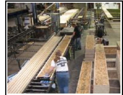
AcuJoist fabrication line in Kelowna, BC.